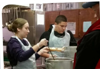
Thank you also to the Winema 4H Club from Tulelake, California for serving a meal February 21.

You may read my words to the ladies, but they have my private thank you to them who saved me from my sadness.”